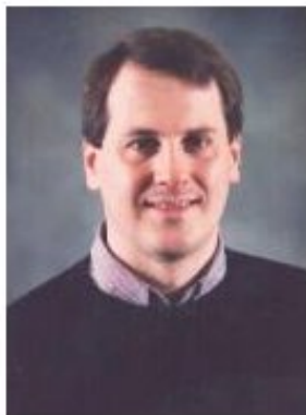
Figure 1—A JPEG image of the author.