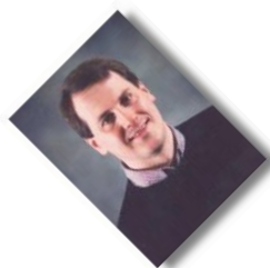
Figure 2—Image of the author scaled by 0.5 and rotated by 45°.