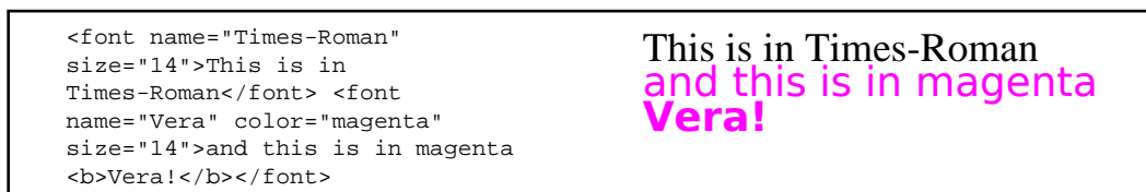
Figure 3-7: Using TTF fonts in paragraphs